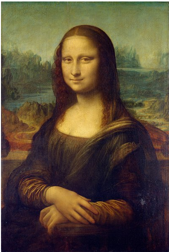
Figure 4.2: It's Mona Lisa again. Hello, here is some text without a meaning. This text should show what a printed text will look like at this place. If you read this text, you will get no information. Really? Is there no information? Is there a difference between this text and some nonsense like "Huardest gefburn"? Kjift – not at all! A blind text like this gives you information about the selected font, how the letters are written and an impression of the look. This text should contain all letters of the alphabet and it should be written in of the original language. There is no need for special content, but the length of words should match the language.

Here is a picture of Mona Lisa (Figure 4.2), as an example. The captions are formatted as the marginnotes; to change the options you can use \captsetup from the caption package.