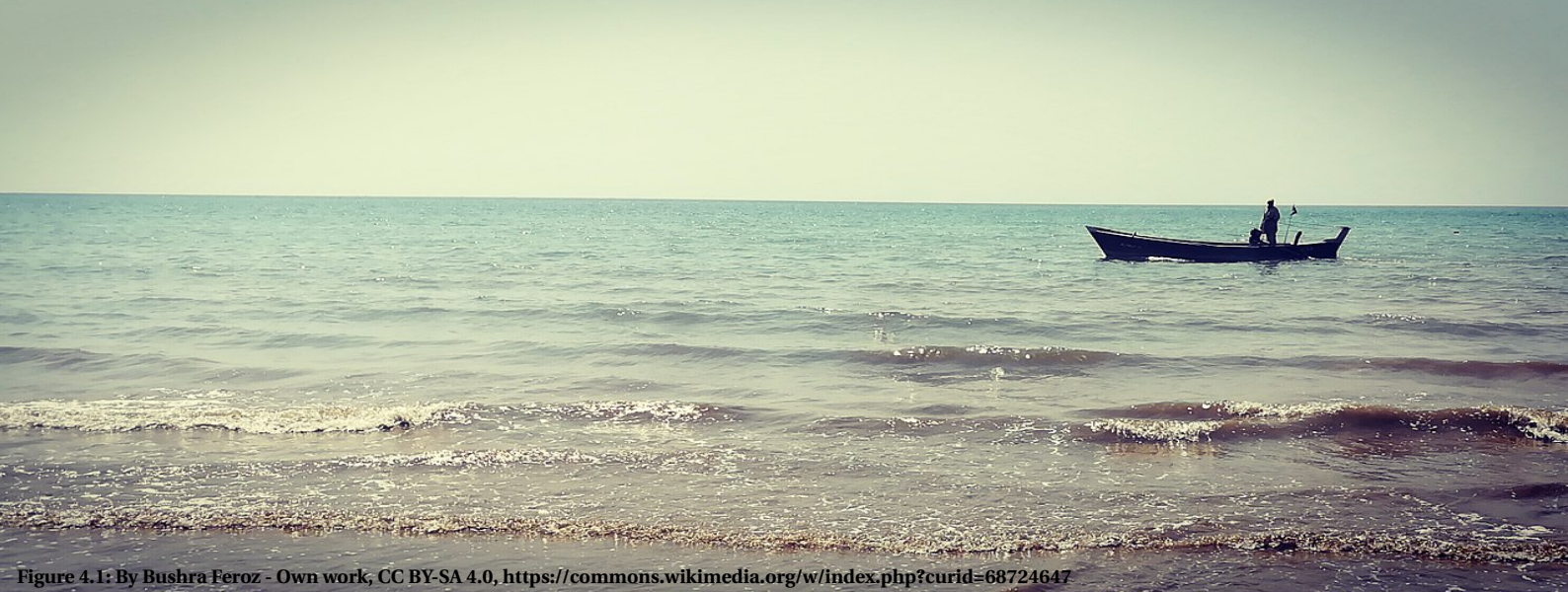
Figure 4.1: By Bushra Feroz - Own work, CC BY-SA 4.0, https://commons.wikimedia.org/w/index.php?curid=68724647