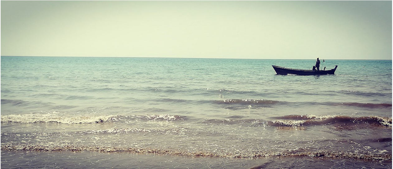
Figure 4.3: A wide seaside, and a wide caption. Hello, here is some text without a meaning. This text should show what a printed text will look like at this place. If you read this text, you will get no information. Really? Is there no information? Is there a difference between this text and some nonsense like “Huardest gefburn”? Kjift – not at all! A blind text like this gives you information about the selected font, how the letters are written and an impression of the look. This text should contain all letters of the alphabet and it should be written in of the original language. There is no need for special content, but the length of words should match the language.

in of the original language. There is no need for special content, but the length of words should match the language.