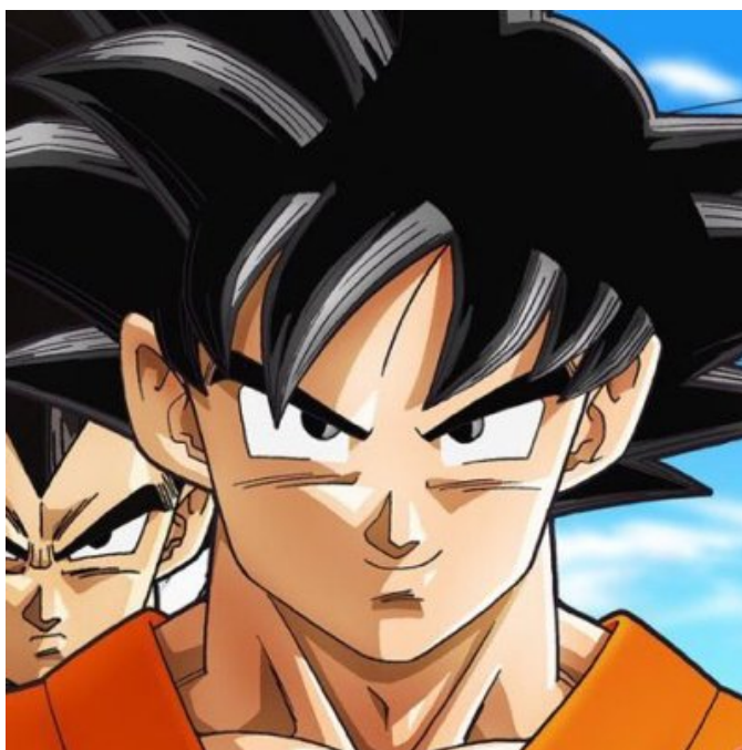
Figure 1.1: A test figure. This caption is huge, but in the list of figures only the smaller version in the square brackets will appear.

language. There is no need for special content, but the length of words should match the language.