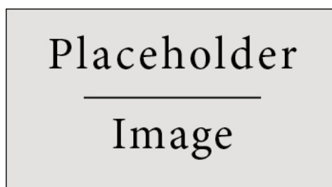
Figure 3.1: Figure caption